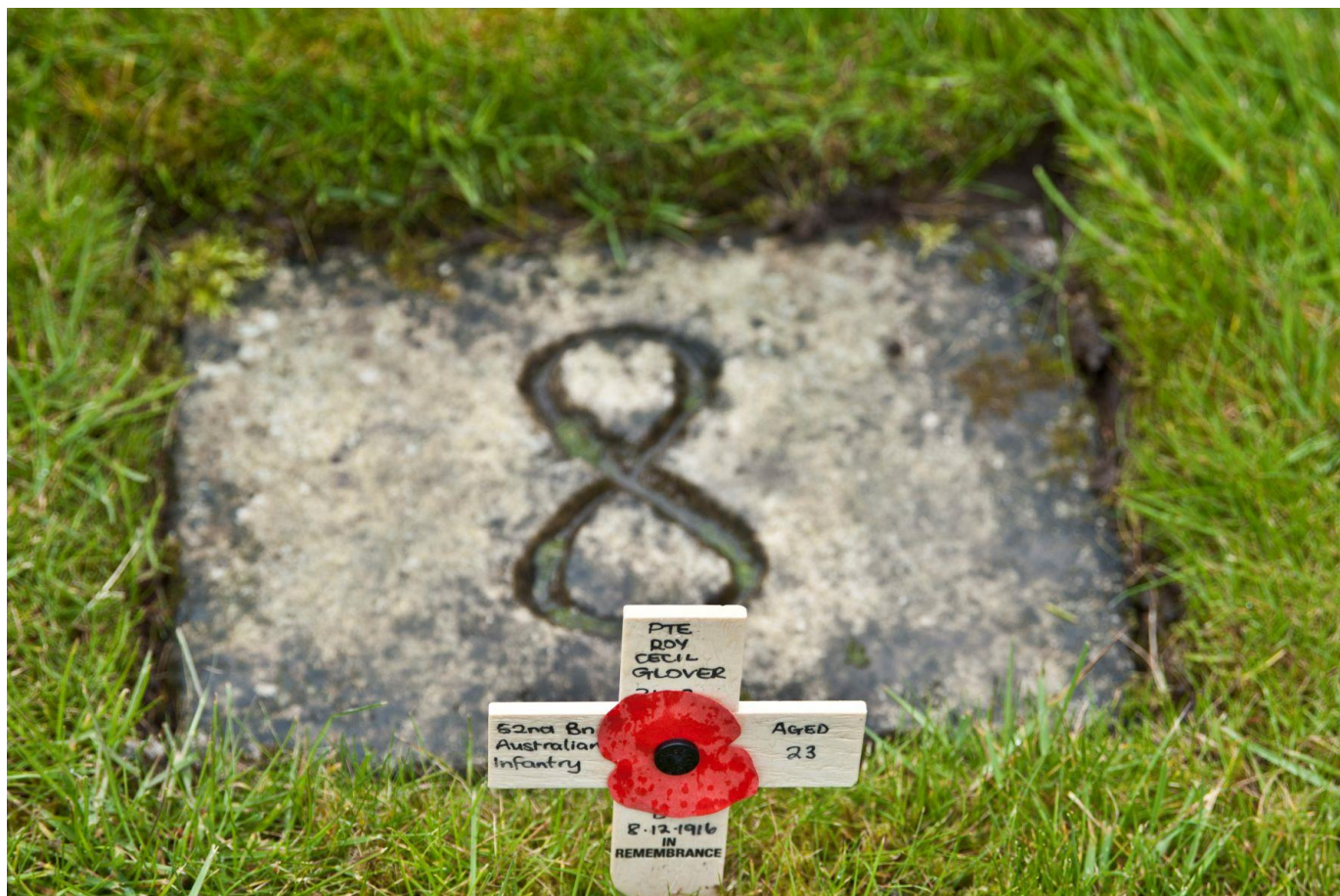
ANZAC Day Commemorations