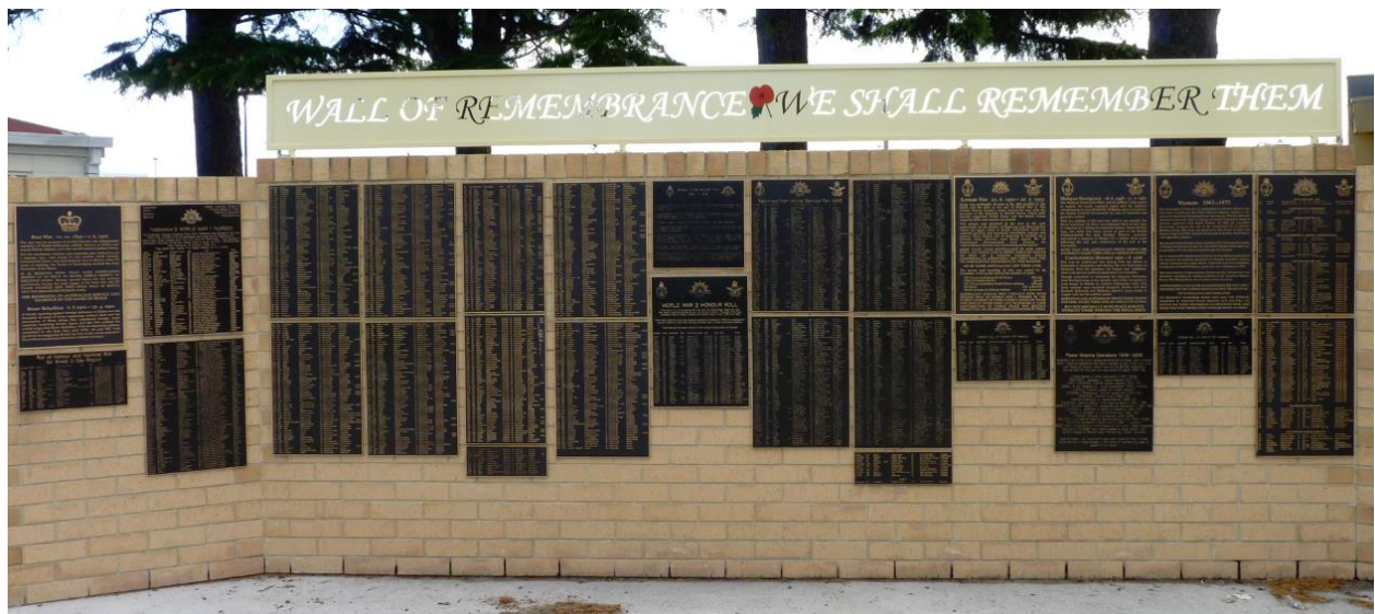
Wall of Remembrance, St. Helens, Tasmania

"What these men did nothing can alter now. The good and the bad, the greatness and the smallness of their story will stand. Whatever of glory it contains nothing now can lessen. It rises, as it will always rise, above the mists of ages, a monument to great hearted men; and for their nation, a possession forever. "