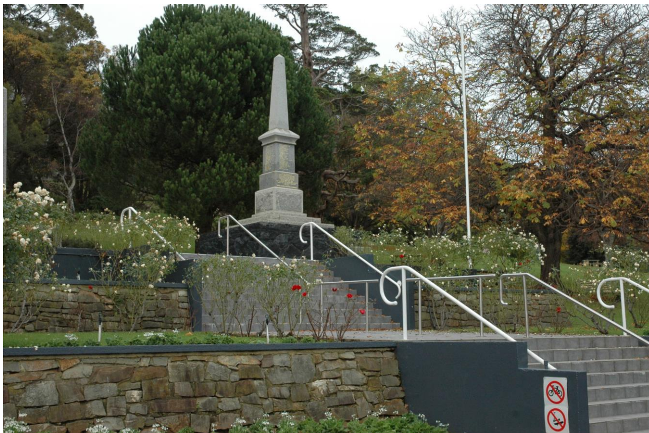
Burnie War Memorial