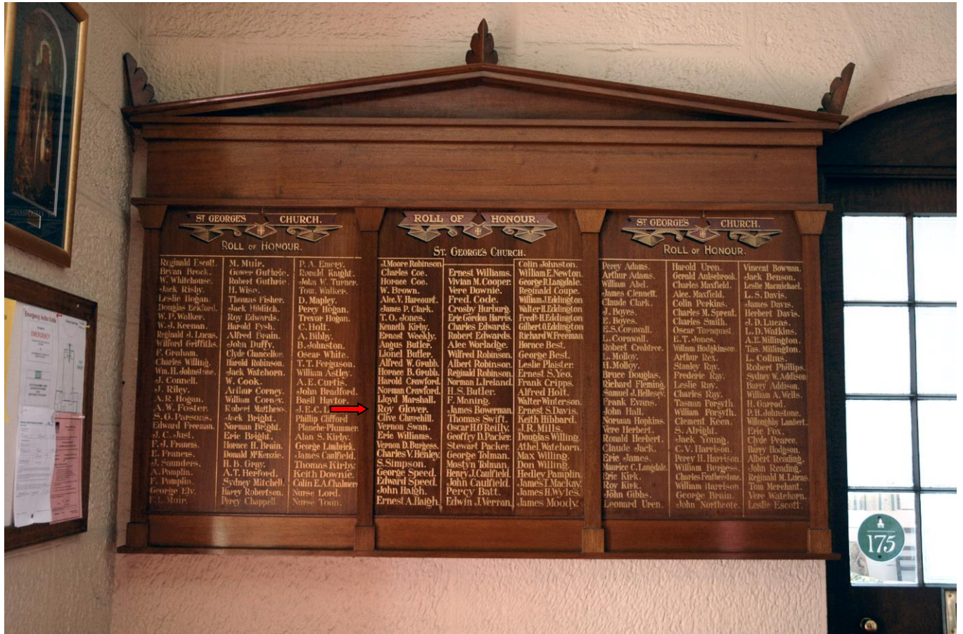
St. George's Roll of Honour