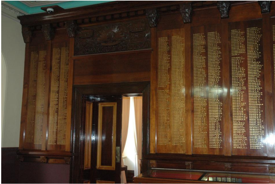
Hobart Roll of Honour

R. C. Glover is remembered on the Hobart Roll of Honour, located in Town Hall Foyer, 50 Macquarie Street, Hobart, Tasmania.